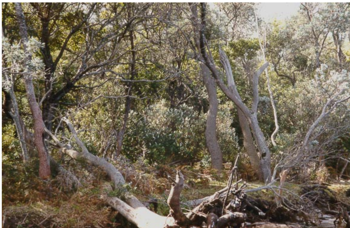
Coast Banksia Woodland on Rigby Island, Gippsland Lakes.

Restricted to coastal or near coastal localities inland behind secondary or tertiary dunes or on sand sheets inland from Coastal Dune Scrub Mosaic. Usually dominated by an overstorey of Coast Banksia Banksia integrifolia var. integrifolia over tall shrubs of Coast Tea-tree Leptospermum laevigatum . Scramblers such as Bower Spinach Tetragonia implexicoma are common in the understorey with a groundcover of grasses, herbs and sedges.